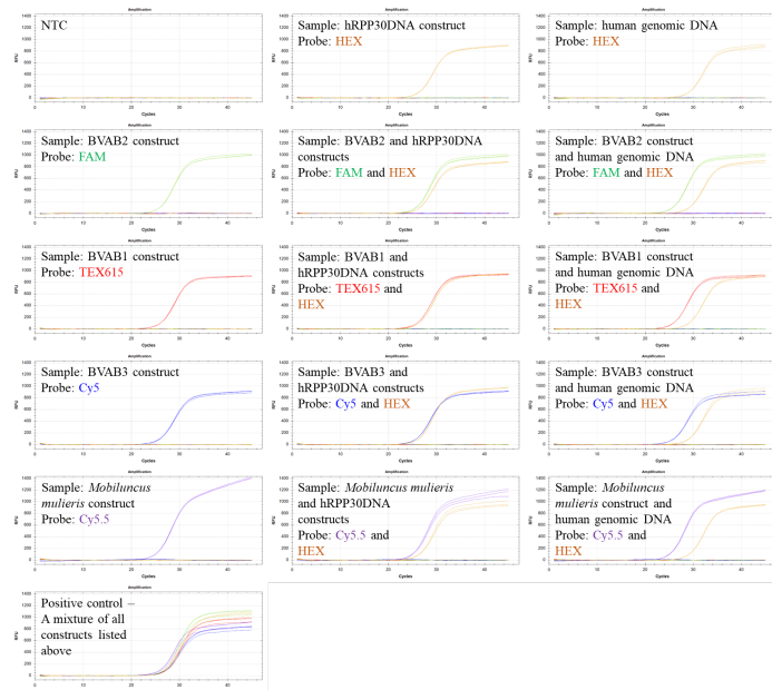
Figure 1: Verification experiments with single targets (given in text boxes for each panel). All sets of probes and primers are present in every reaction, but positive signal is only observed when the target(s) is present, indicating that the amplification is specific.

The limit of detection (LOD) was estimated by performing serial dilution experiments in triplicate ( Figure 2 ). For dilution series only target construct was added. The results show a limit of detection (LOD) <10 copies/reaction.