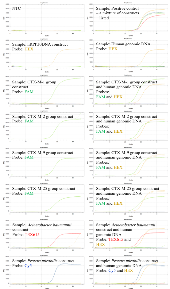
Figure 1: Verification experiments with single and multiple targets (given in text boxes for each panel). All sets of probes and primers are present in every reaction, but positive signal is only observed when the target(s) is present, indicating that the amplification is specific.